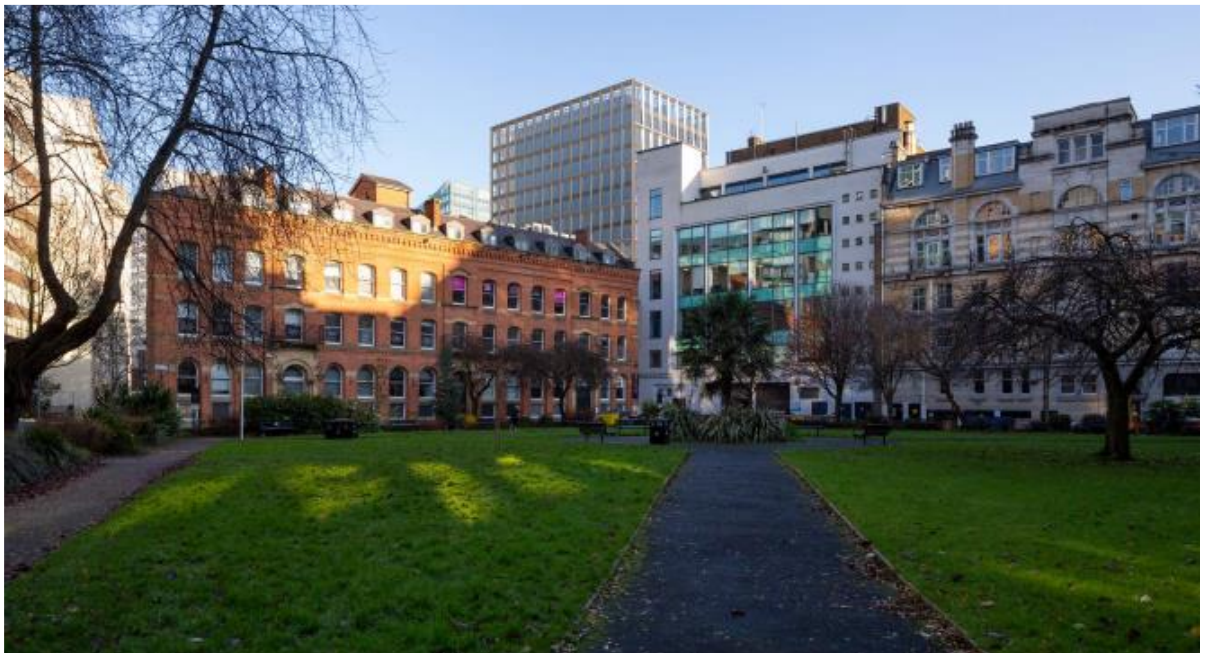
View 5 Proposed

For View 6, the change to the view is not considered adverse. The proposal would appear as a strong vertical form but would appear lower than the Royal Exchange which would allow it to retain prominence in the view. The form and architectural style of the proposal is distinctly different, with significant areas of glazing which would allow the form of the Royal Exchange Tower to remain distinct and the proposal to function as a backdrop. The impact on this view is considered to be negligible adverse.