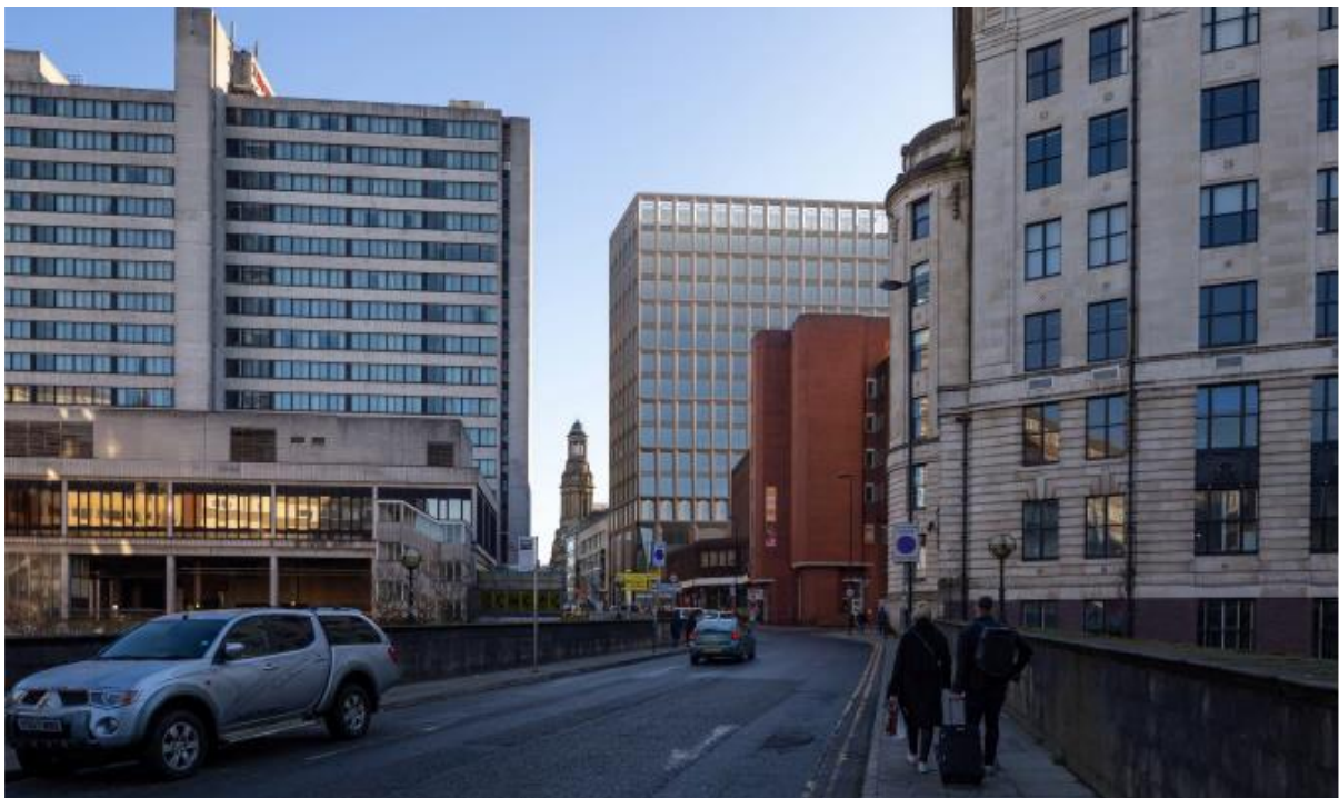
View 3 Proposed

In View 4, the proposal would be read as a new, landmark on the skyline forming a contemporary backdrop. It would be highly visible above the exiting roofline, however any adverse impact would in part be reduced by the detailed design which reflects the architectural rhythm of the streetscape and adjacent Grade II* listed Barton Arcade. The proposal would re-establish the historic street line and thereby enhance the character and appearance of the St. Ann's Square Conservation Area and the setting of the Grade II* Barton Arcade Building. The Grade I listed Cathedral remains the central focal point of the view to the far distance. The building would alter, but not