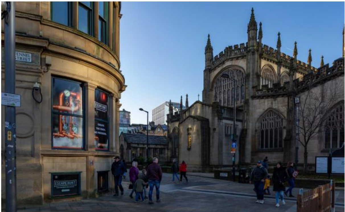
View 8 Proposed

View 9 is to the right of Spinningfields Square, with the Grade I listed John Rylands Library to the left and the Grade II listed building at 105-113 Deansgate dominating the middle ground. No.1 Deansgate is visible in the far distance. The proposal would be highly visible, creating a distinctive landmark in the distance. The development would alter, but not diminish, the intrinsic values of the identified heritage assets, or the experience and appreciation of the buildings or the designated area to any