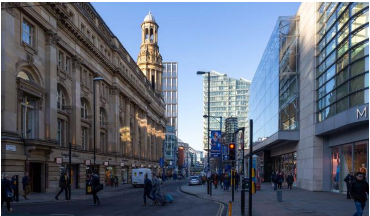
View 6 Proposed

In View 7, the proposal would be read as a landmark terminating the view in the far distance. It would be highly visible, but not impede on the ability to understand or appreciate the heritage values of the heritage assets including the Grade II* listed Barton Arcade and the Grade II listed building at 15-17 King Street. The proposal would contribute to the mix of architectural styles creating a contemporary backdrop to the view. The proposal would have no adverse impact upon the settings of any heritage assets in the view, so would have a neutral heritage impact.