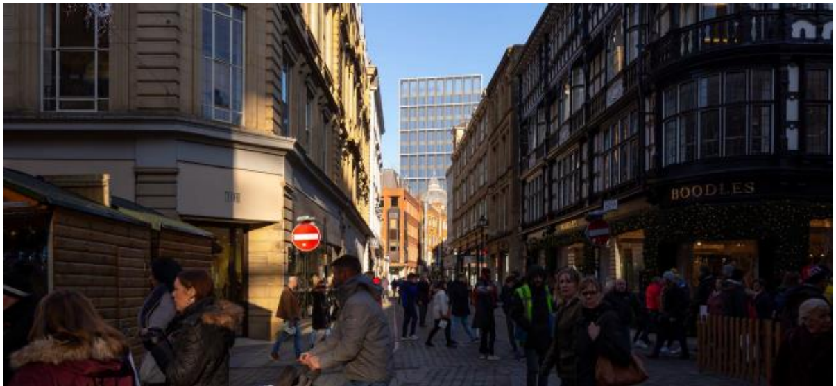
View 7 Proposed

In View 8 the proposal would terminate the view in the far distance. The development would correspond with the height and contemporary nature of No.1 Deansgate and both would be subservient to the Grade I listed Cathedral, which would continue to dominate the view. The proposal would not intrude on the way in which the Grade I listed Cathedral and Grade II listed Corn Exchange are understood and appreciated, so the impact from View 8 is considered to be neutral.