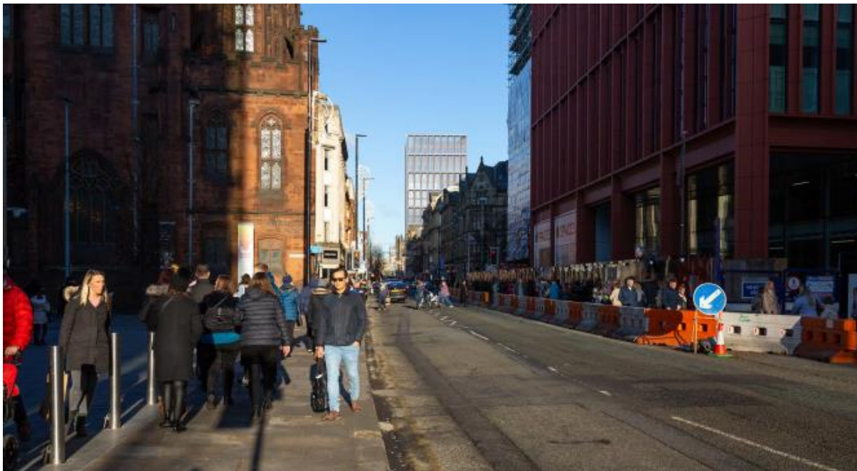
View 9 Proposed

View 10 is at the north end of Deansgate, with the Grade II* listed Barton Arcade to the right and the Grade II listed Hayward Buildings to the left. The Grade I listed Cathedral terminates the view in the far distance. The proposal would re-establish the historic street wall and has been designed to respond to the architectural qualities of the adjacent Grade II* Barton Arcade. The double height arch detail to the street frontage emulates that of the Barton Arcade, enhanced by the inclusion of decorative metal banding. The recessed corner follows the character and appearance of other buildings within the St. Ann's Square Conservation Area. The development would