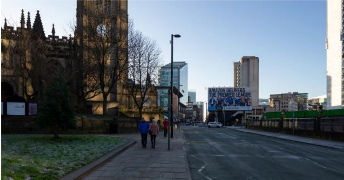
View 2 Existing