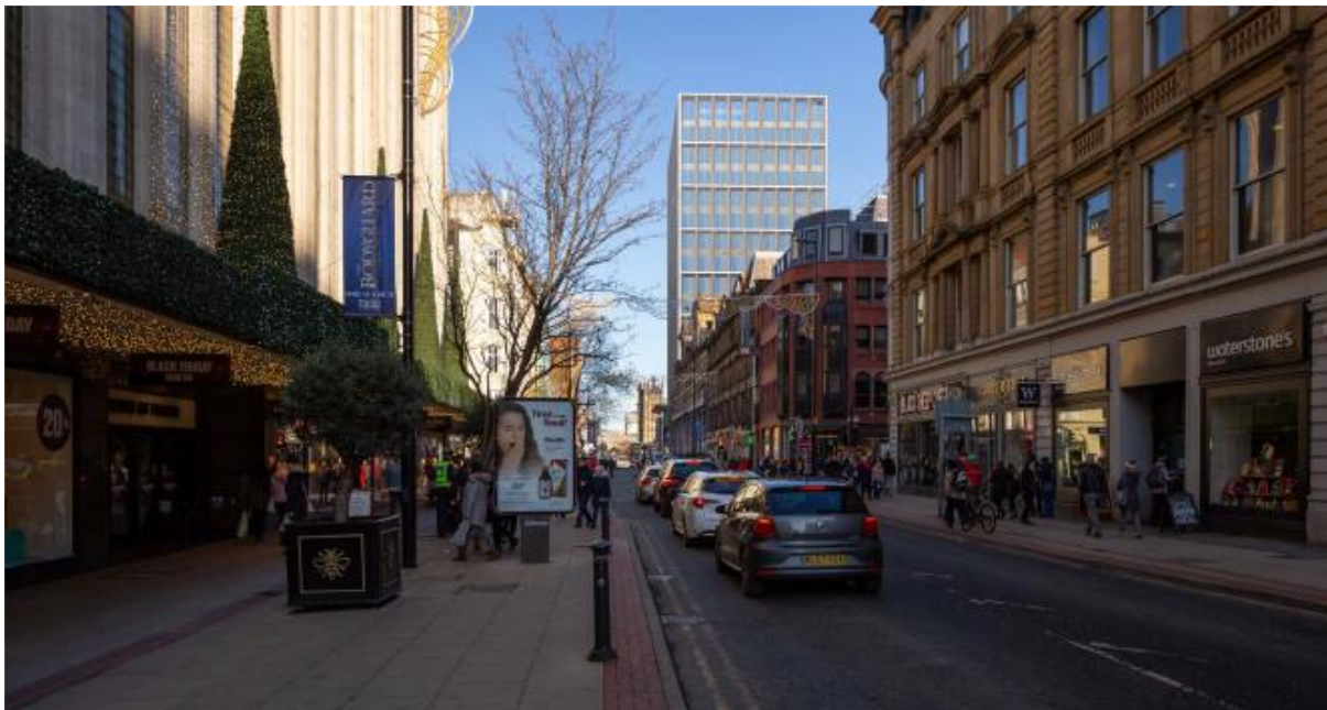
View 4 Proposed

In View 5 the proposal would be viewed in conjunction with the buildings that frame Parsonage Gardens. The proposal would be viewed as a contemporary addition to the skyline beyond and would not intrude on the ability to understand or appreciate the character and appearance of the Parsonage Gardens Conservation Area. It is considered that the impact of the proposal within this view would be negligible adverse.