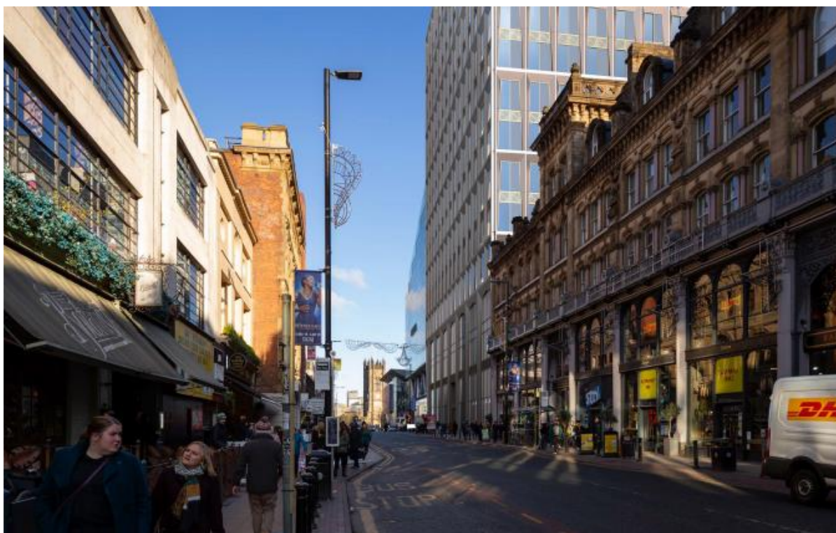
View 10 Proposed

Of the 10 Views assessed, the proposal would result in 1 instance of minor beneficial; 3 of neutral; 5 of negligible adverse; and 1 of moderate adverse. Consequently, it is considered that the proposal would not result in any “harm” as defined within the NPPF. Despite having an adverse effect on the setting of the group