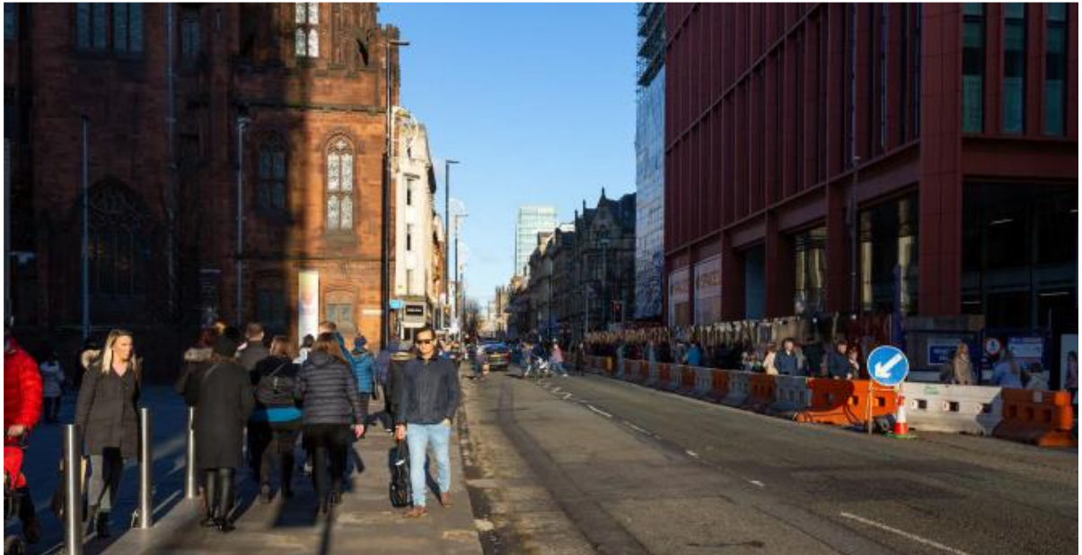
View 9 Existing

appreciable degree. The impact of the proposal is considered to be negligible adverse.