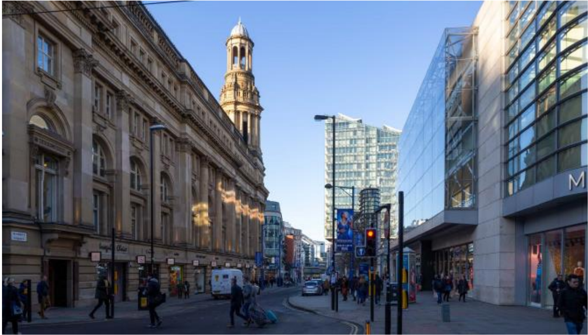
View 6 Existing