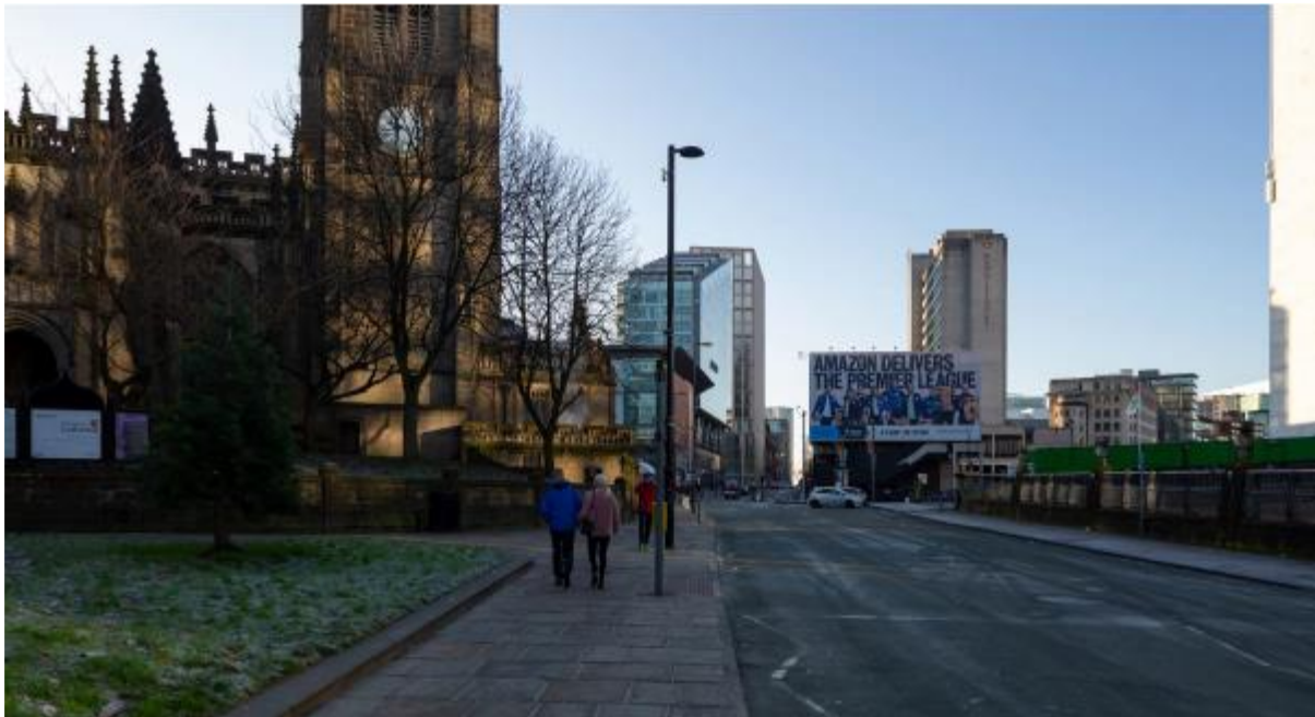
View 2 Proposed

From View 3, the proposal would terminate the view, creating a new landmark within the central shopping district and would be read as a complementary addition to the wider townscape. It would be taller than the existing building but would introduce a viewing corridor which would promote key views towards the Grade II listed Royal Exchange in the far distance and would enhance kinetic views between the Parsonage Gardens Conservation Area and into the St. Ann's Square Conservation Area. The proposal would enhance the Deansgate and St. Mary's Gate junction and would not diminish the intrinsic values of the heritage assets in this view or the ability to appreciate them. As such the impact on heritage would be negligible adverse.