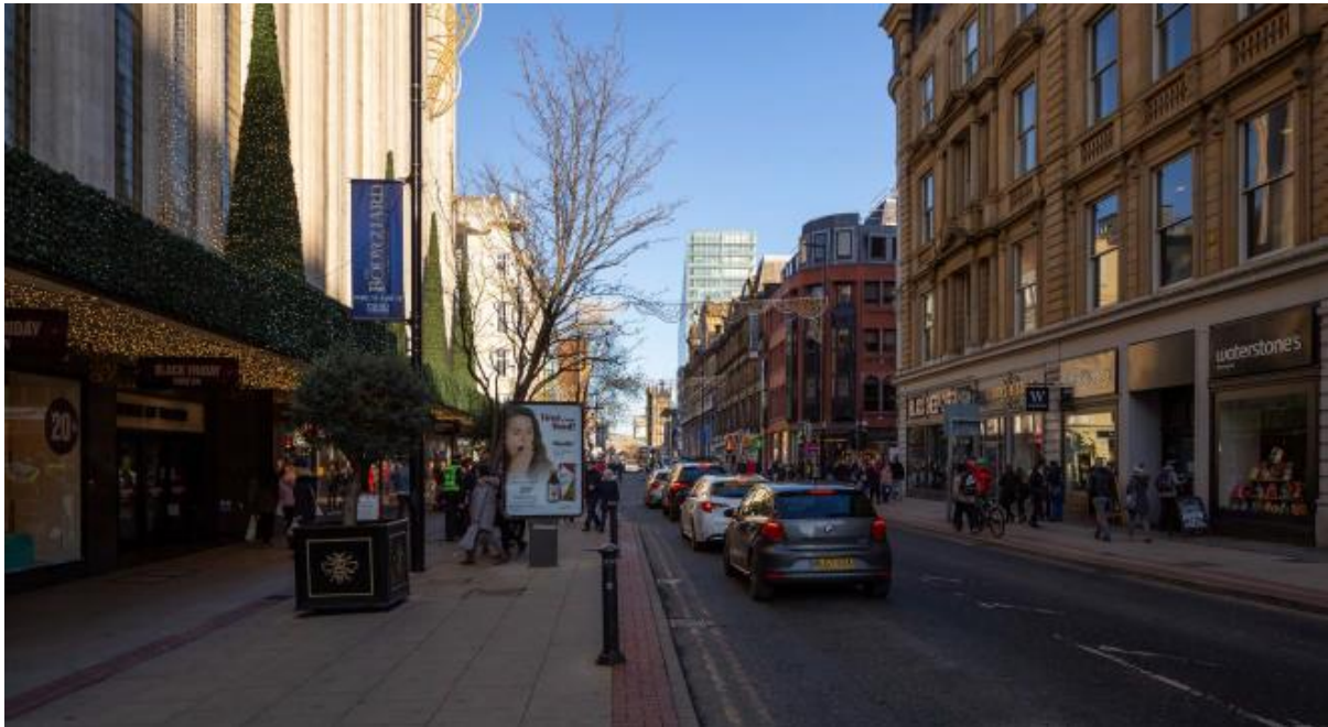
View 4 Existing

diminish, the intrinsic values of the identified heritage assets and the experience and appreciation of the buildings to any appreciable degree and the impact would be negligible adverse.