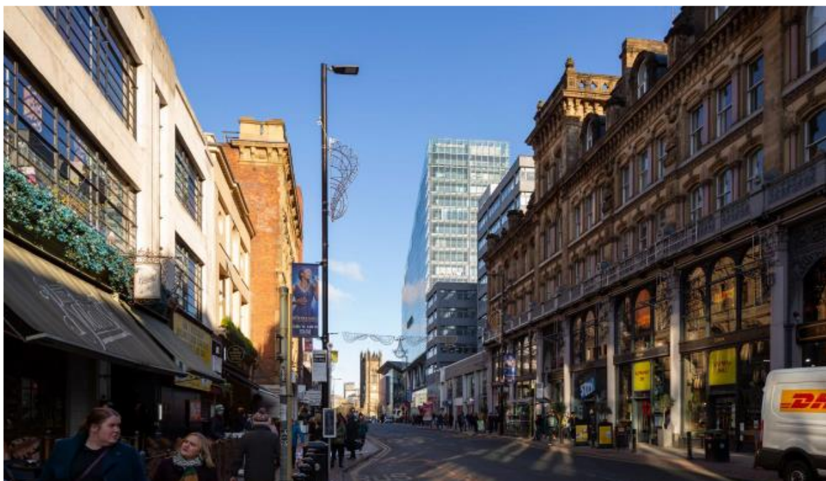
View 10 Existing

improve the public realm at street level. The proposal would have a minor beneficial impact from View 10.