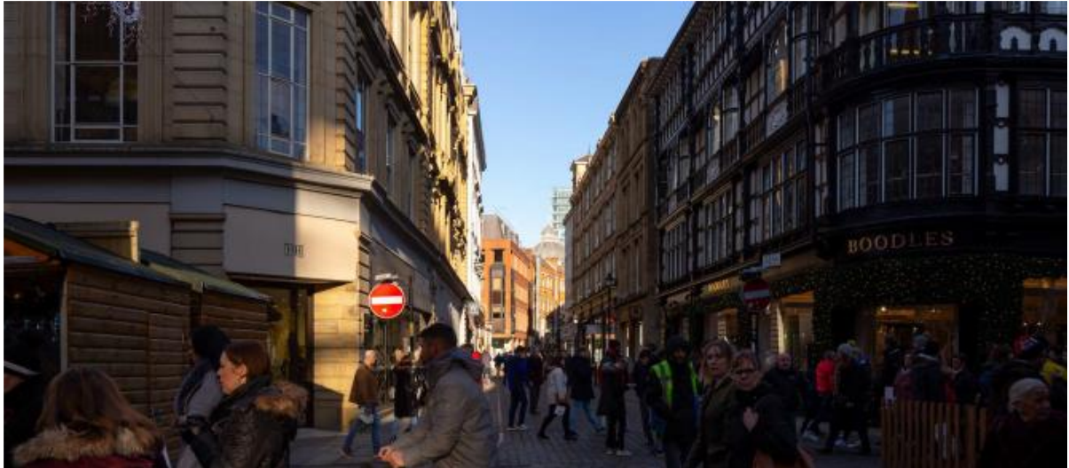
View 7 Existing