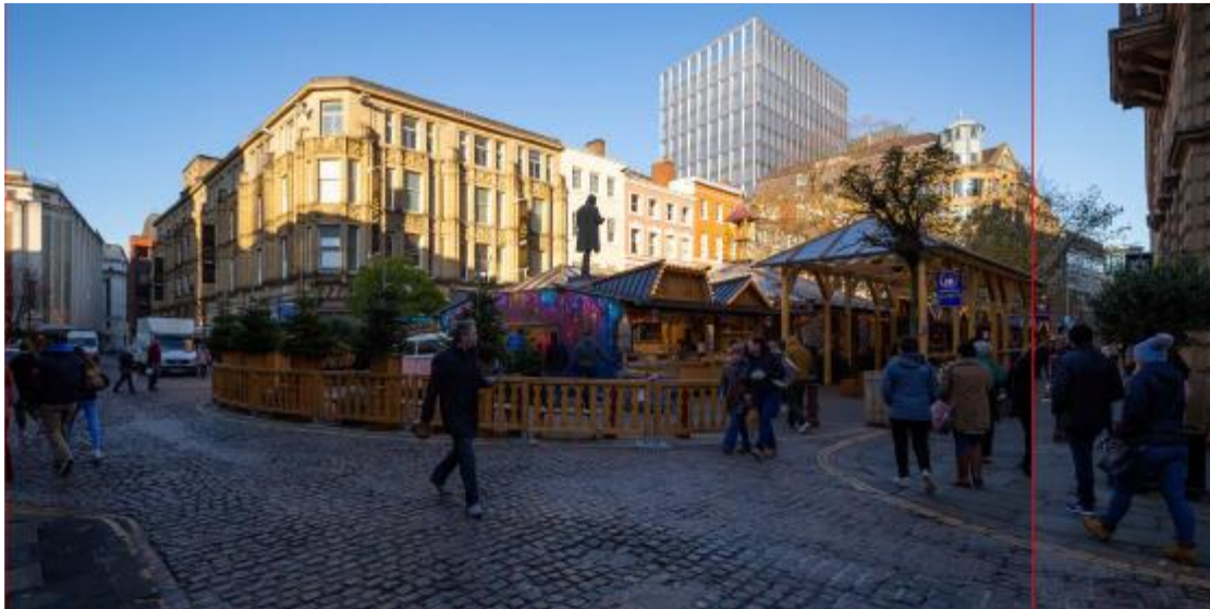
View 1 Proposed

In View 2, the proposal would largely be obscured by No.1 Deansgate, which is a similar height. The heritage values of the Grade I listed Cathedral would continue to be understood and fully appreciable and the proposal would be read as a contemporary development in keeping with the urban skyline in the distance. It is considered that the proposal would have a neutral heritage impact.