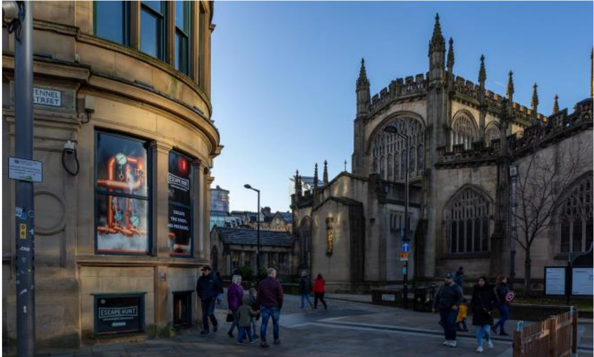
View 8 Existing