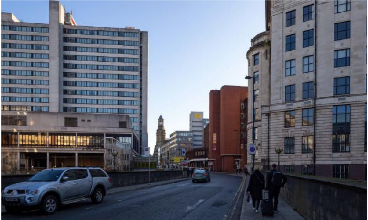
View 3 Existing