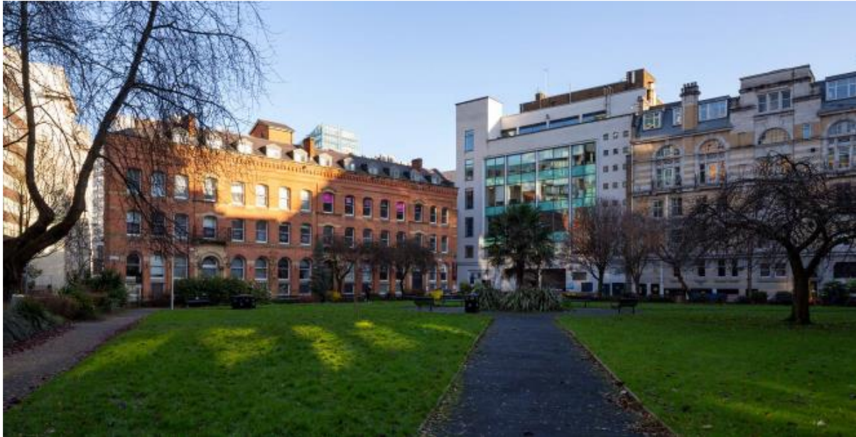
View 5 Existing