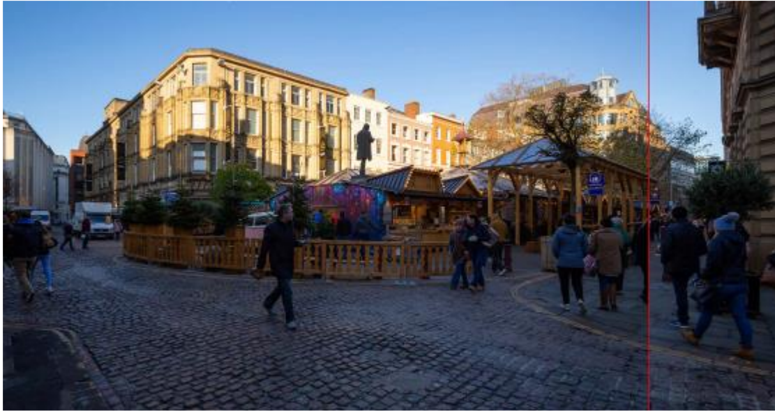
View 1 Existing